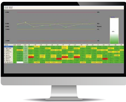
Current and earlier measurement data & tool service life