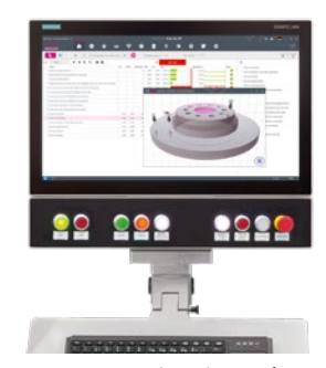
M4P measurement and analysis software control panel