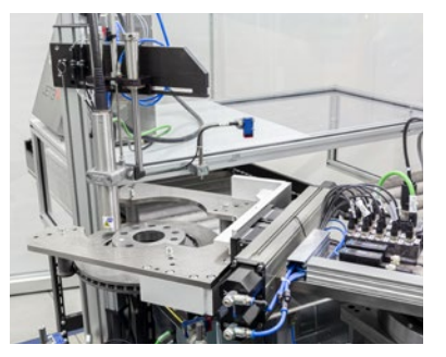
Option of integrated inkjet printer