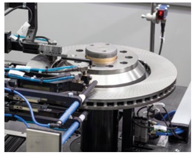
Simultaneous recording of features